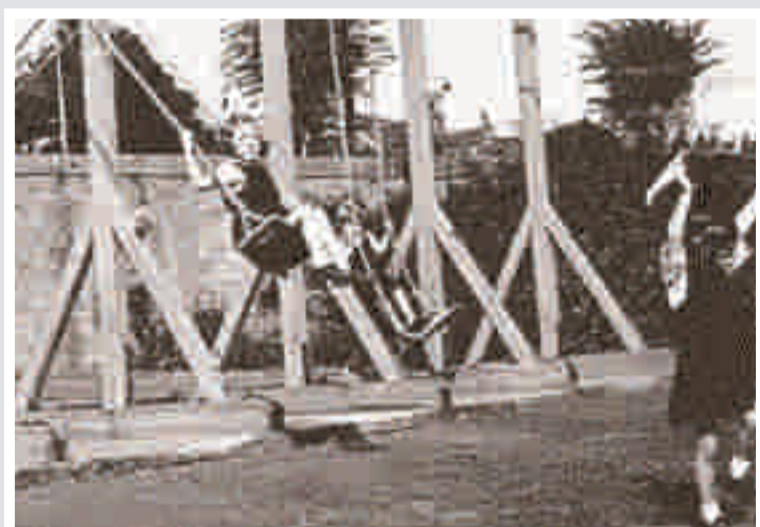
Below: Children play in the gardens of the house.

"Boys were kept at the east end of the building and girls at the west end, and never the twain would meet," says Brenda about the old orphanage. "Even for meals they sat at opposite ends of the dining room."